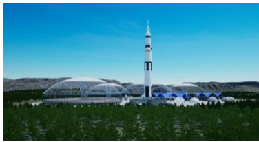
External View of Expo

In order to raise young peoples' awareness of the expanding UK Space industry and the career opportunities that are flourishing across the sector, the careers education charity 4wardFutures are hosting a Virtual Space Futures Careers Expo that will be launched on the 19 th July 2021 . Following the launch, the Expo will continue to expand and become an interactive virtual environment through which 4wardFutures, and their industry and university partners can deliver projects and host events throughout the year.