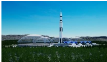
External View of Expo

In order to raise young peoples' awareness of the expanding UK industry and the career opportunities that are flourishing across the sector, the careers education charity 4wardFutures are hosting a Virtual Space Futures Careers Expo that will be launched on the 19 th July 2021 . The Expo will not be one-off event ; it will be available 24:7 throughout the year for people to visit. Through collaboration with partners from the space and related sectors, the Expo will continue to expand, build links with partners from across the world, and become an interactive virtual environment through which 4wardFutures, and their partners can deliver projects and host events throughout the year.